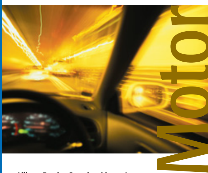
Allianz Dealer Prestige Motor Insurance Product Disclosure Statement and Policy Document.